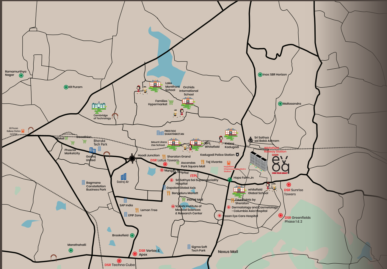
Map not to scale.